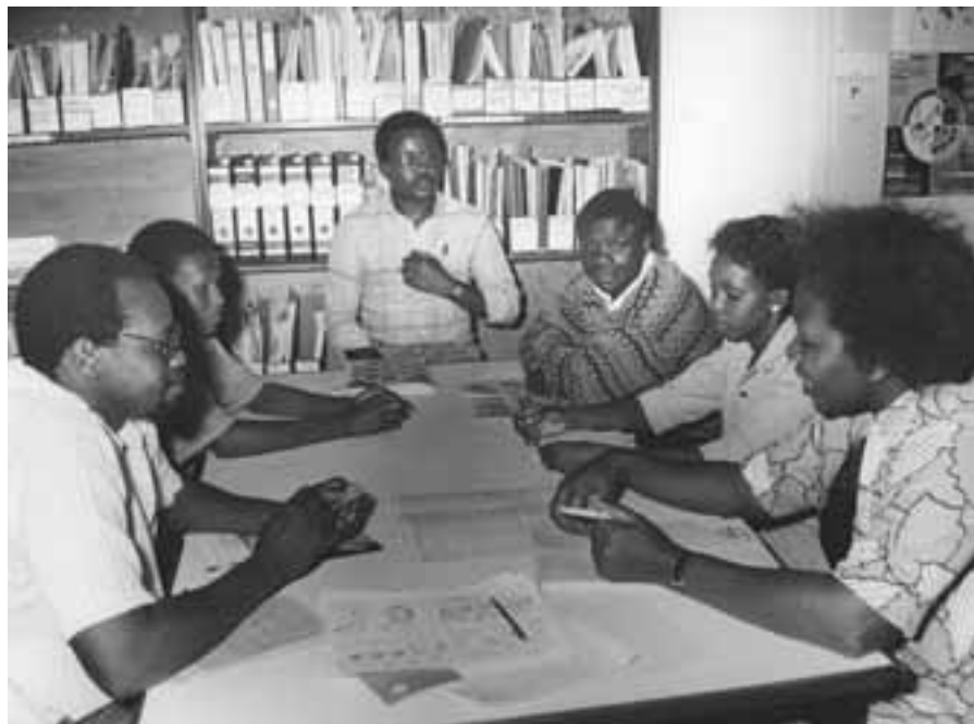
AIDS educators work on materials for youth.

The curriculum should provide teachers with basic reproductive health knowledge, including information related to the transmission, diagnosis, and treatment of STIs and HIV/AIDS. Teachers should be able to explain clearly the dangers arising from STIs and HIV, provide basic information about the infections, and give clear instructions about the actions needed to prevent STIs or treat them effectively. Basic information on pregnancy prevention, the fertile period during the menstrual cycle, and contraception is also needed. Ideally, teachers would also receive information on sexual expression and orientation, although this area remains controversial. Training should also help teachers understand a broader range of adolescent behavioral and psychosocial development issues, so they can assist students with problem-solving, critical thinking, interpersonal relationships, empathy, and the ability to cope with stress.