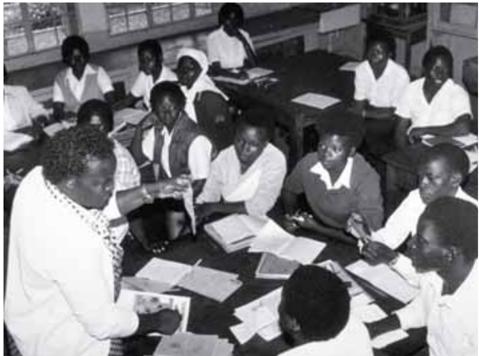
Young people receive a lesson on safe sex.

7. Teachers need support after the initial training. A variety of strategies, including refresher courses, mentoring, and supportive supervision, can help ensure long-term impact from training. Major changes in attitudes and behaviors are not likely to happen in a short period of time.