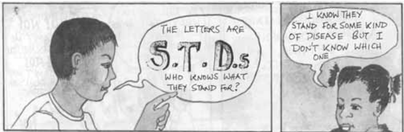
Teachers need training to use a variety of materials, including comic books that appeal to youth. These images are from Good Health , used by the Kenya Institute of Education.

Teacher training in the context of RH/HIV often challenges existing norms for educational institutions and the community. As communities take a greater interest in the topic, some may want to include only limited information, for example, eliminating any discussions of condoms from a curriculum. Sexuality education may not be considered as important as reading or mathematics, and given the usual limitations on resources and time, it may be the first subject to be reduced or eliminated from a school curricula. Reproductive health material is not usually on examinations because the content is often taught as part of an after-school club or is not part of the national curriculum, leading teachers to spend less time on it compared to those subjects on which their students will be tested. Teachers need preparation, skills, and support in dealing with all of these issues.