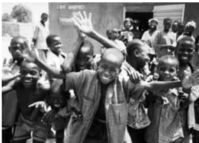
Teachers can serve as guides, role models, and resources for school children, such as these pouring out of a school in Mali.

The HIV/AIDS epidemic in developing countries has resulted in more attention to developing student curricula and training teachers to use the curricula. “All ministries of education are implementing one or more interventions to combat the epidemic in the education system,” reported the Association for the Development of Education in Africa in a 2001 review of regional