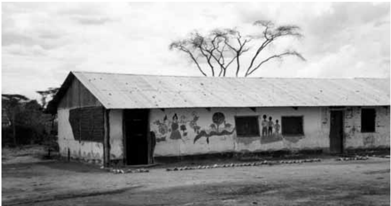
An inadequate infrastructure contributes to the challenges facing teachers in this school in rural Kenya and other parts of Africa.

Without clear guidance from mandated policies, teachers may avoid controversial areas. Evaluations of teacher training programs show that teachers frequently fail to teach topics in which they have been trained because they feel uncomfortable with the subject, they are inadequately trained, or they lack materials. 15 A review of 11 African school-based HIV prevention programs identified selective teaching as a problem, especially regarding controversial areas such as condom use. 16 An in-depth analysis of how an HIV/AIDS curriculum was taught in western Kenya (and in a state in India) by Action Aid, a United Kingdom-based group, found that some teachers select which messages to give, choose not to teach HIV at all, or rely "solely on messages on abstinence.... Sexually active youths will not only feel excluded from messages forbidding premarital sex, but will also have limited access to potentially life-saving information." 17