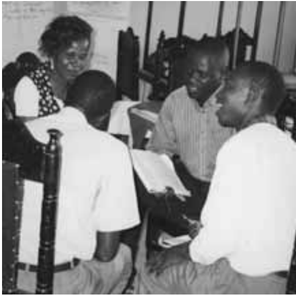
Teachers in Kenya get training on new materials and facilitation skills.

level, and so on through five stages until the local-level teachers were finally reached. The model could, in theory, reach the 35,000 teachers involved in AIDS education. The pre-service component included the introduction of AIDS education curriculum into the 27 tertiary colleges under the Ministry of Higher Education in 1994.